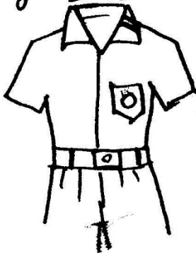
Diag. 5, Boys XI-XII