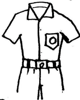
Diag. 2. Boys I-X